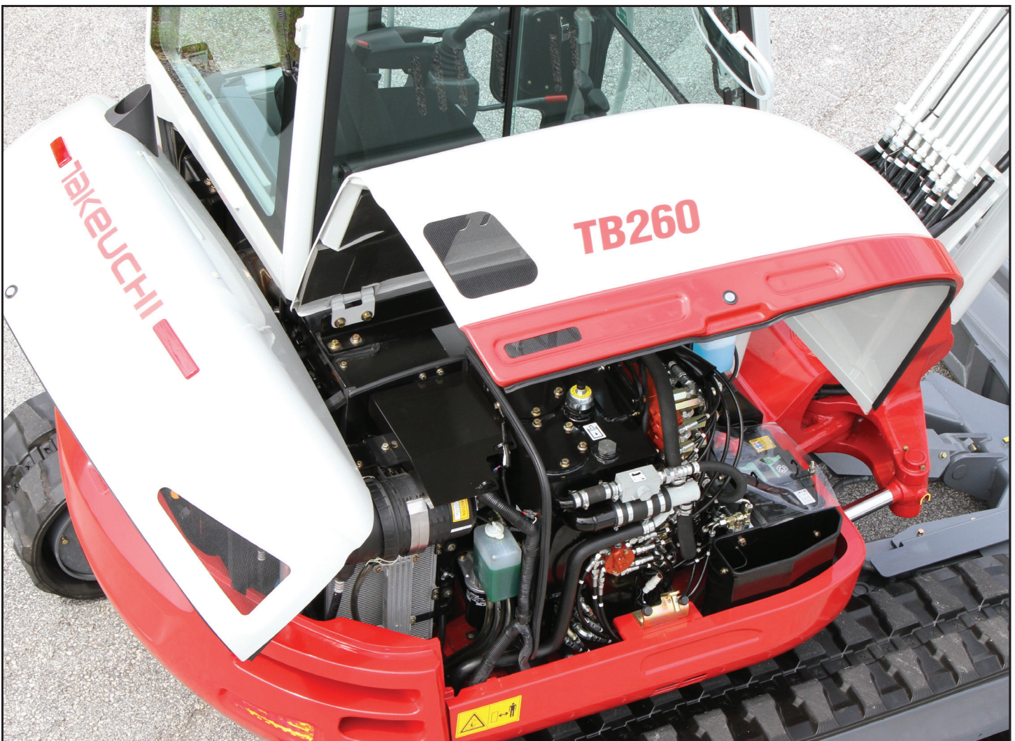
Large lockable service hoods provide vandalism protection and outstanding maintenance access.

Additional features include automatic idle, heavy duty cooling module, and a large wraparound counterweight that protects engine components from damage.