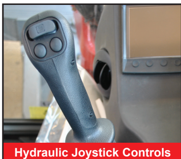
Hydraulic Joystick Controls