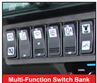
Multi-Function Switch Bank