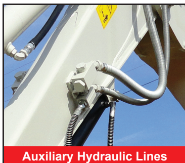
Auxiliary Hydraulic Lines