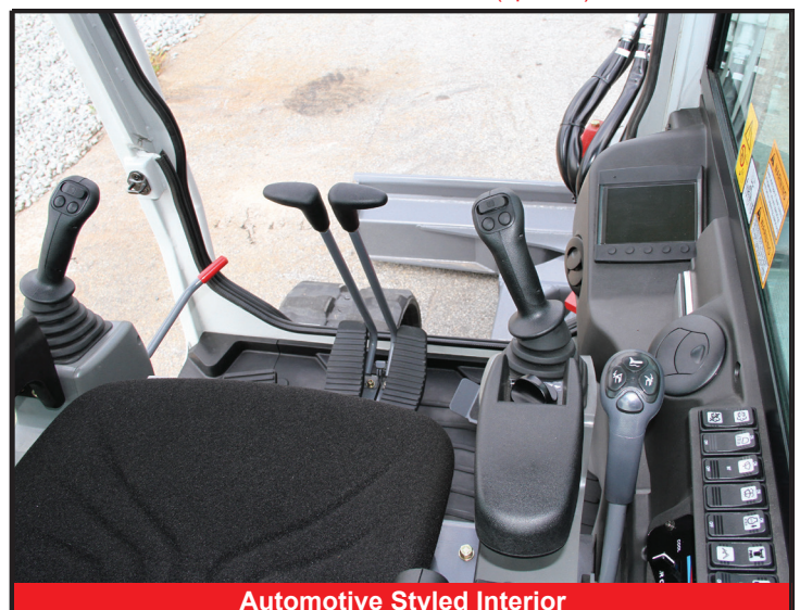
Automotive Styled Interior

*Functions may not be available in all countries, so please consult your Takeuchi dealer for details.